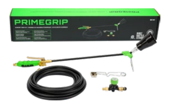
88-341 ECONOMY FIELD TORCH KIT