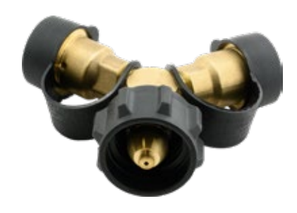
88-116 PROPANE TANK Y-SPLITTER