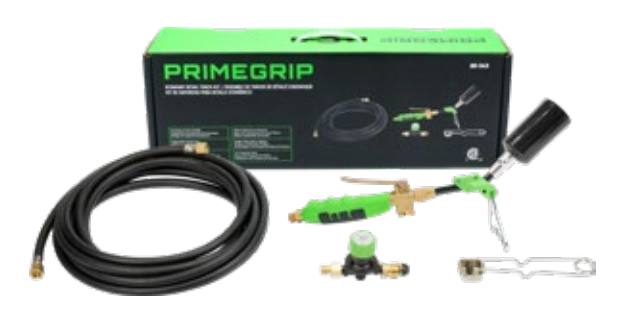
88-343 ECONOMY DETAIL TORCH KIT