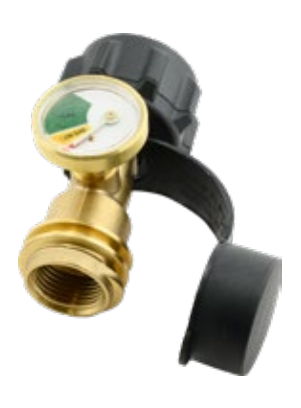
88-115 PROPANE TANK GAUGE